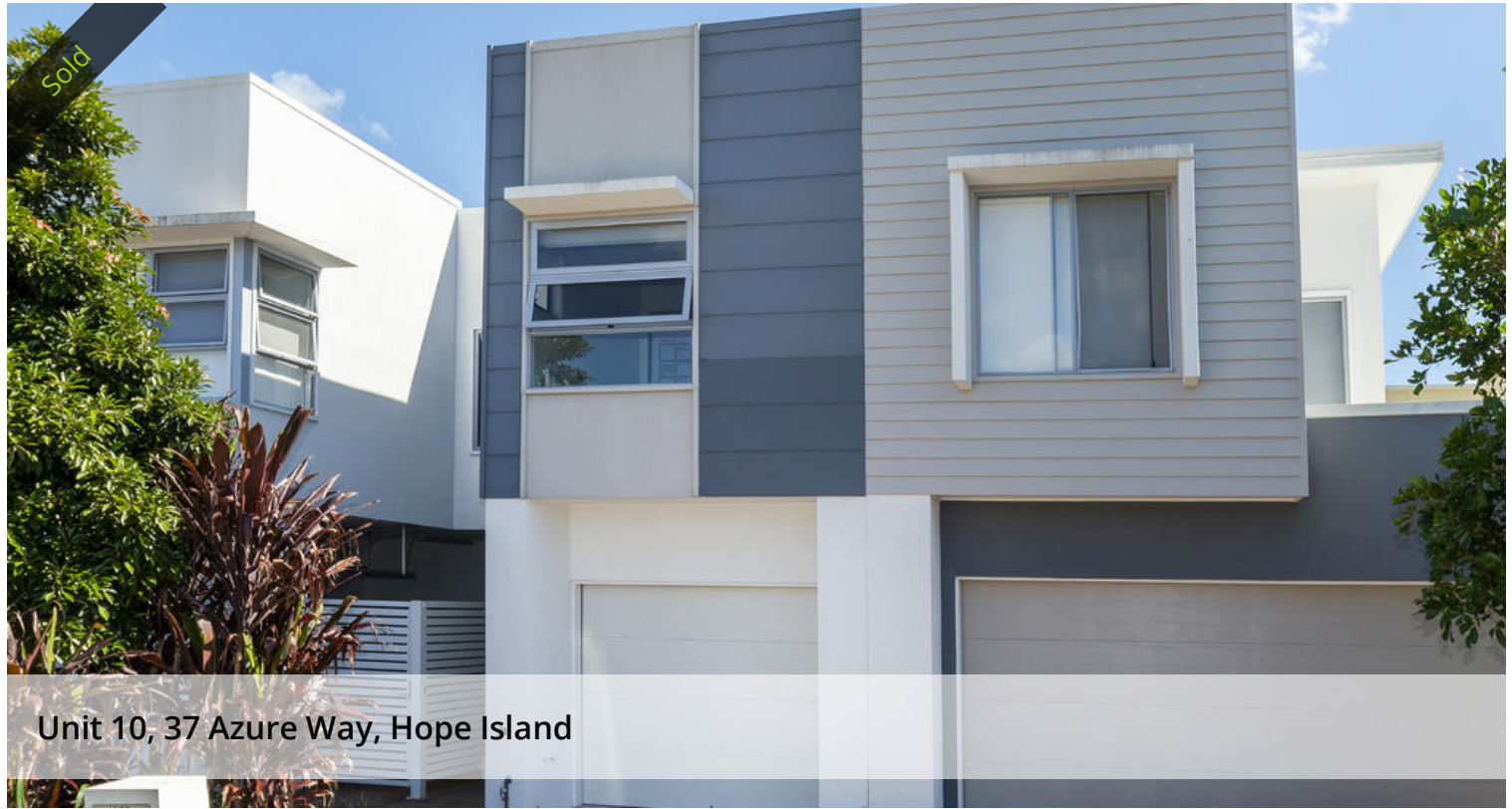
Unit 10, 37 Azure Way, Hope Island