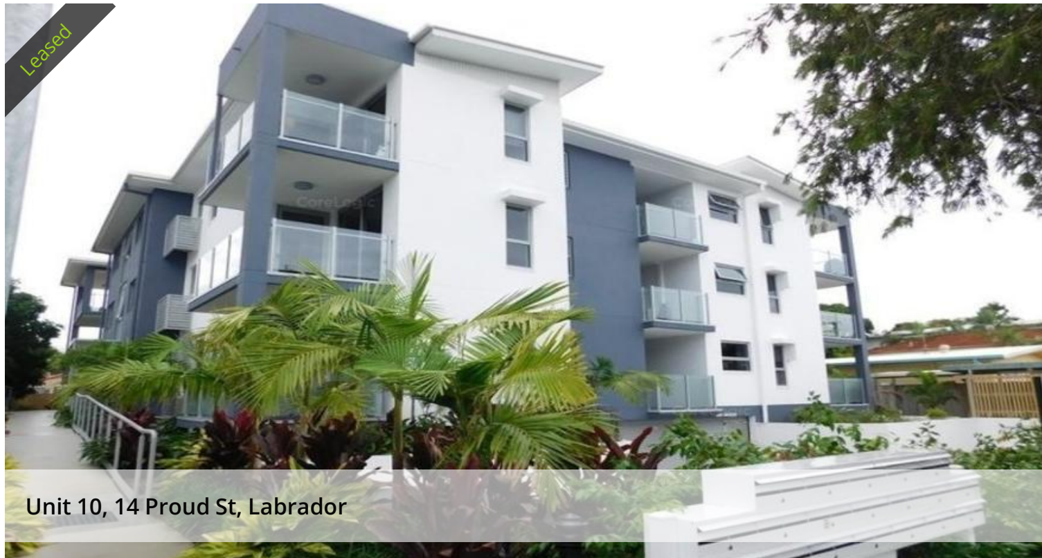
Unit 10, 14 Proud St, Labrador